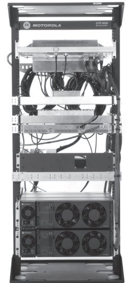
GTR 8000 Site Subsystem

Information Assurance capabilities are standard with G-series equipment and can be configured or disabled depending on your specific system maintenance and security requirements. G-series products provide the necessary boundary defense capabilities required in mission critical infrastructure today including local user accounts and password controls, user privilege model support (two levels), local and remote access services controls, secure shell services support, SNMPv3, central authentication, general operating system and network services hardening, and device test services controls.