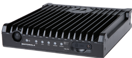
VML750 LTE Vehicle Modem