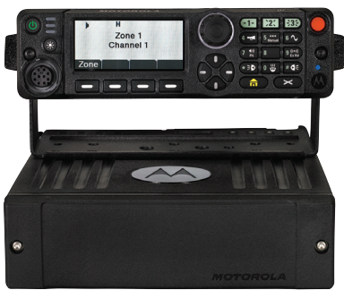
APX 8500 All-Band Mobile Radio